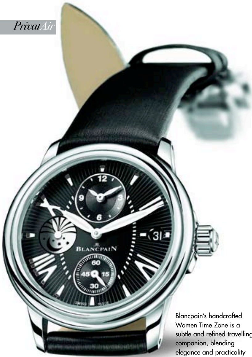
Blancpain's handcrafted Women Time Zone is a subtle and refined travelling companion, blending elegance and practicality