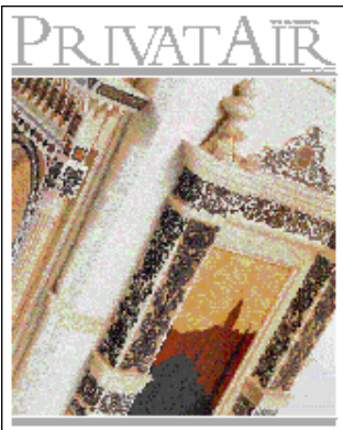
Cover: Turkish humidior from David Linley. Each face represents one of the ceremonial gateways to Istanbul.

PrivatAir SA Chemin des Papillons 18 PO Box 572 1215 Geneva 15 Telephone +41 22 929 6700 Fax: +41 22 929 6701 E-mail: info@privatair.com www.privatair.com