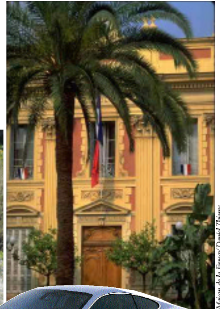
Maçon de La France